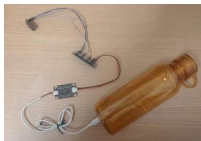
Fig. 3. Hardware Setup

used to detect the conductivity of water, and the ESP32 was responsible for analyzing data before displaying it on the OLED display screen. The results obtained from the evaluation show that the system measured and categorized water quality. Table II shows the experimental results for various water samples. The results illustrate the efficiency of the system under consideration in terms of determining whether the drinking water is safe or not safe.